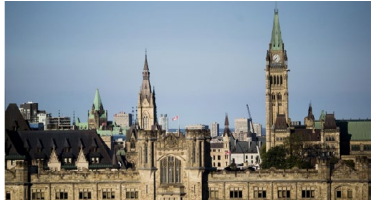
Parliament Hill stands in Ottawa, Ontario, Canada, on Thursday, Aug. 16, 2018. It makes sense for the U.S. and Mexico to meet bilaterally on Nafta on certain issues and Canada looks forward to rejoining talks on the trilateral pact in the coming days and weeks, Prime Minister Justin Trudeau said.

In an effort to preserve and even build up capacity for seafood harvesting, the T'Sou-ke First Nation on southern Vancouver Island turned to Victoria-based MarineLabs, which collects real-time data about the ocean, about 18 months ago to better understand what's going on in the Sooke Basin and other areas it uses. Click here to read more..